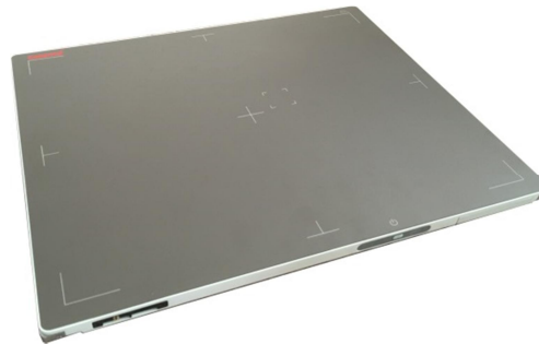
Flat panel Detectors WiFi, AED, CsI, 14x17inch, 17x17inch