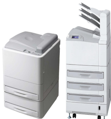
Dry Laser Imagers HighCap Xp/XLp General and Mammography