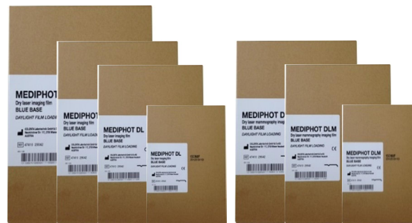
Dry Laser Imaging Film Mediphot DL/DLM General and Mammography