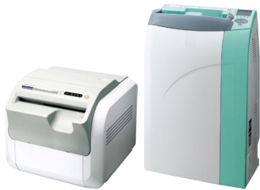
CR Readers HighCap Xr/XMr/XLr General and Mammography

A comprehensive range of CR / DR Retrofit Kits including CR Readers, Flat panel Detectors, Consoles, Software and Accessories in various configurations.