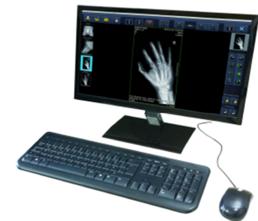
Console for CR/DR System Windows 7 / 8.1 Pro